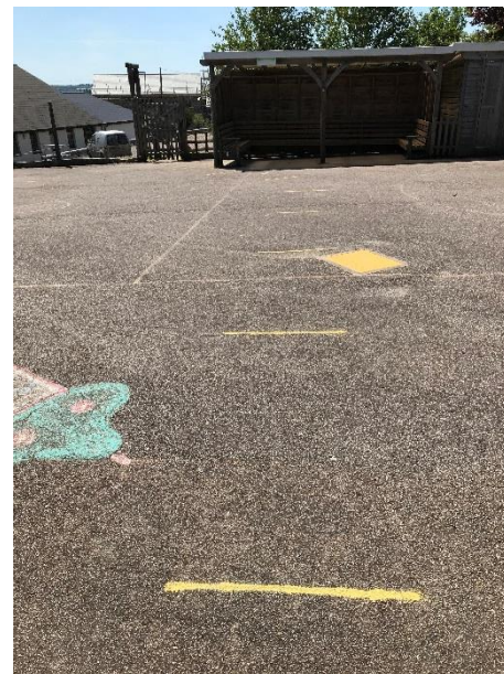
Playground floor markings displaying 2m social distancing to aid drop-off and collection