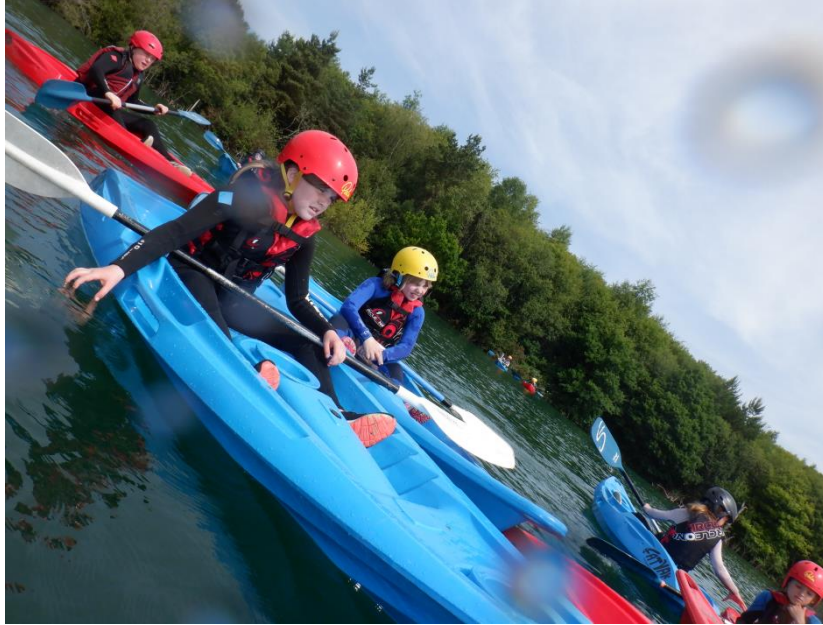
On the water during residential