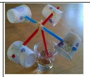
Project 2. Our science focus is Seasonal changes and weather. Can you design your own weather station? Can you explain how it works?

Project 1 . Our focus this term is how we are all special and unique. Can you create a 2d or 3d piece of art that reflects how special and unique you are! It could be a collage, painting, sculpture the sky is the limit! You could use natural materials!